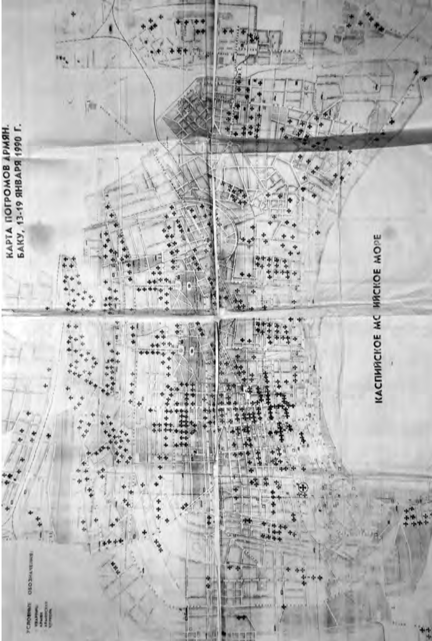
The map of the Armenian pogroms in Baku. Copies of this map were handed to the mobsters; the crosses mark the spots where the Armenian population inhabited — a clear sign of the premeditated nature of the crime.