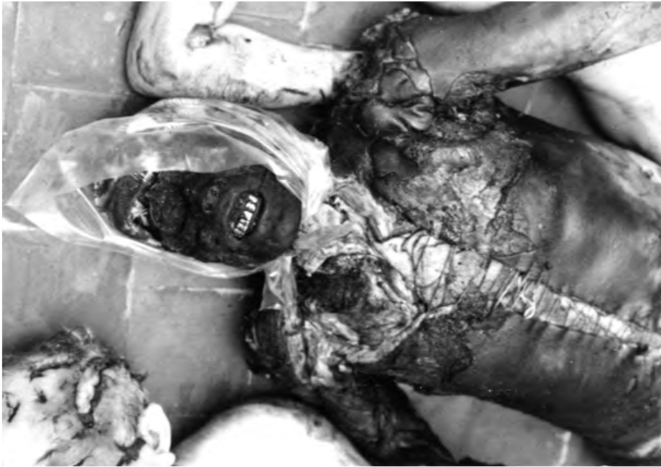
Caption. Victims of Sumgait massacre.