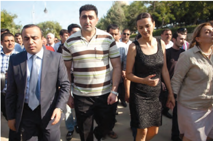
Caption. A “hero’s” welcome