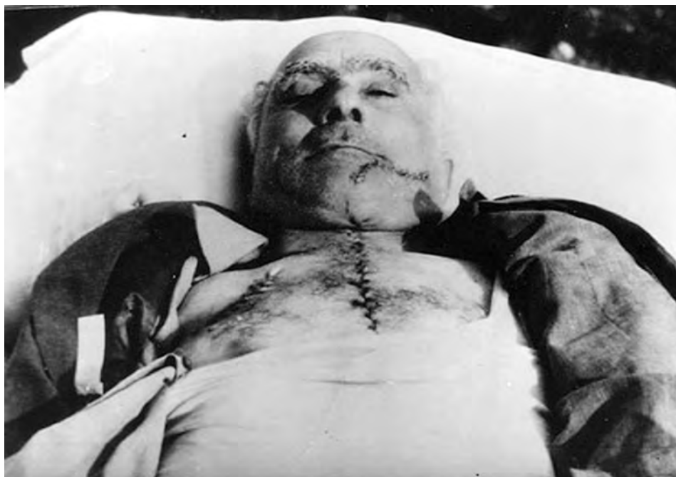
Caption. Victims of the Baku pogroms.