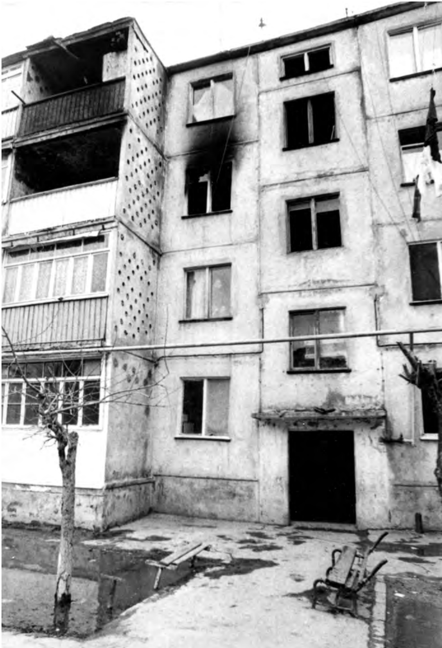
Caption. A building in Sumgait in February 1988. The broken windows of flats belonging to Armenians bear traces of fire.